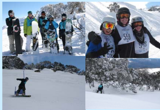
Oxley Snowsports 2009